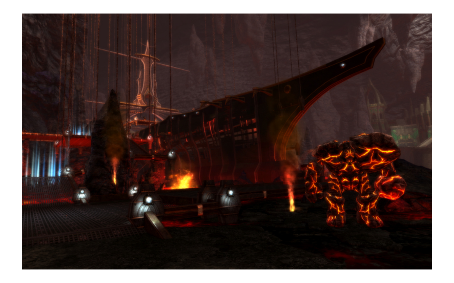
Download ->->-> <a href="http://bit.ly/2JXrwwo">http://bit.ly/2JXrwwo</a>

Shadowrun Chronicles: INFECTED Director's Cut Crack Download Pc Kickass